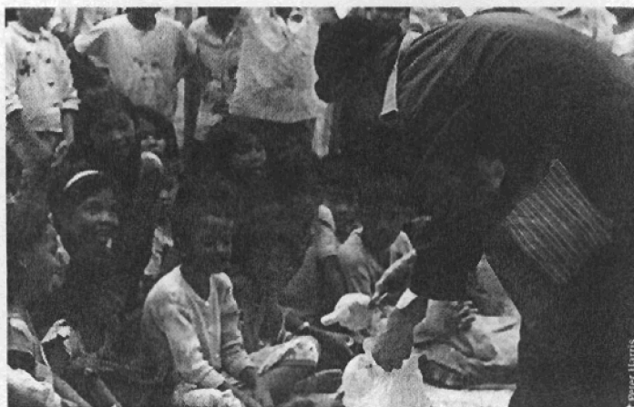
Bolero from Clowns Without Borders, Belgium casts his spell over children from the Mango Tree Garden, using only plastic bags.

healing through “creative play” and the imagination. Although there is plenty of trauma in Cambodia, the trauma is not emphasized, so that the strength and originality of the child is “rediscovered” through cultural and natural resources.